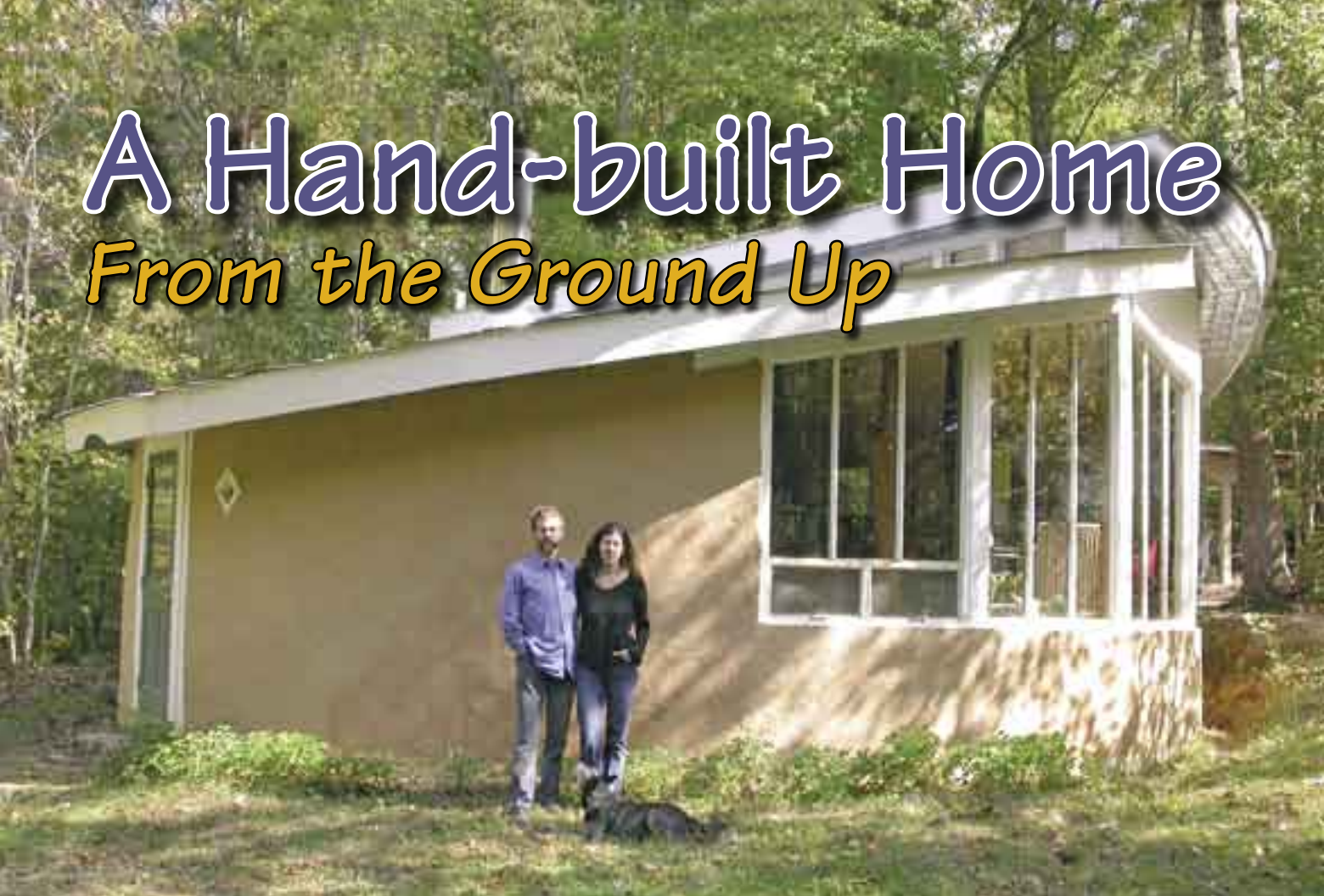
The author and his wife in front of their hand-built cob house in North Carolina.