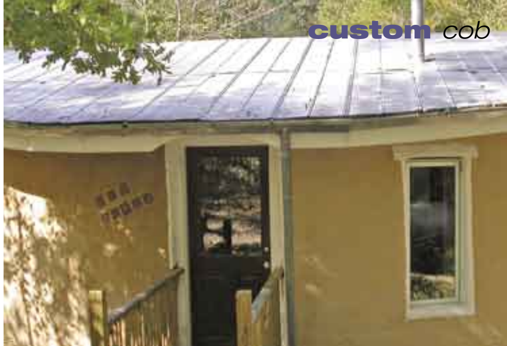
This gently sloped roof puts less weight on the cob walls while simultaneously providing enough of an angle to shed snow.

Plan to incorporate some kind of exterior insulation into your cob home. Near the end of our inspection process, our inspector questioned the insulation value of our 12- to 16-inch-thick (30–40 cm) cob walls. I had been sure they would be adequate, so I was shocked when I discovered their total R-value to be only R-3 or R-4 (about R-0.25 per inch). This was unacceptable, so we had to find a way to insulate the outside of our cob home if we wanted to get our final