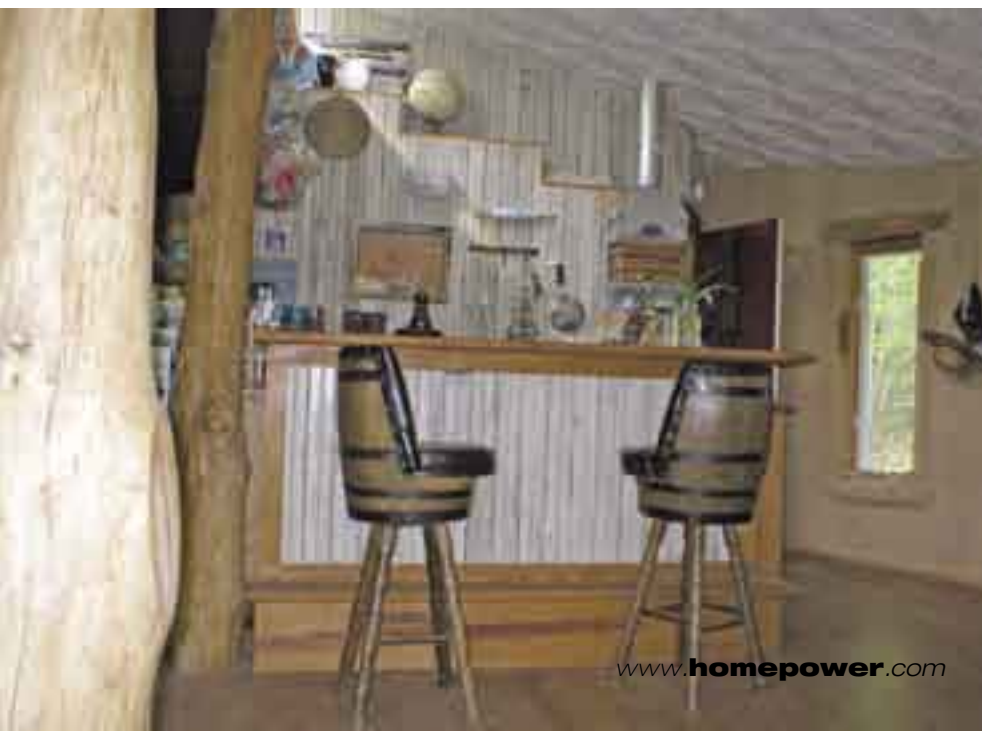
Additional support in the center of the house was necessary to transfer a portion of the roof's load directly to the ground rather than to the walls.

Vermiculite or perlite mixed into the cob. Vermiculite and perlite have an insulation value of about R-2 to R-4 per inch; a 4- or 6-inch-thick (10–15 cm) application would be needed.